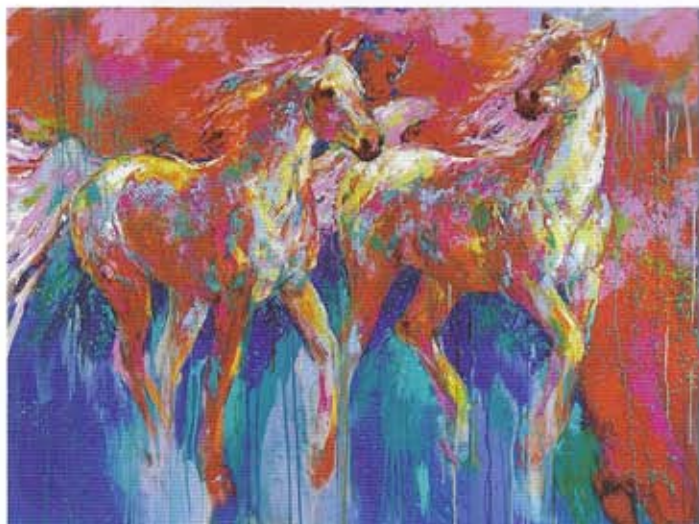
SOMETHING IN THE AIR, OIL ON CANVAS, 36 X 48"